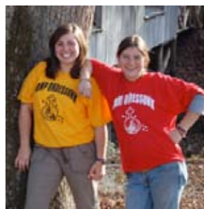
$12 - Previous summer Unit T-Shirts

Your information will be kept confidential. Once your payment has been processed, your card info will be deleted and your credit card receipt mailed to you.